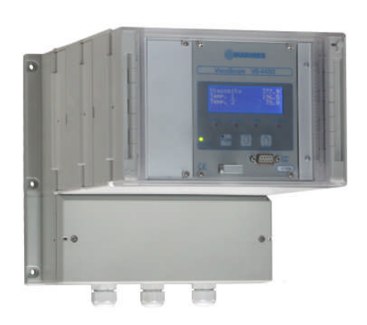
VS-4450 with display, build into wall mount enclosure, IP65